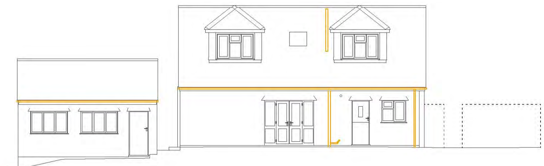
04 Existing Rear Elevation GA North Facing Scale Bar 0 2 4 6 8 10