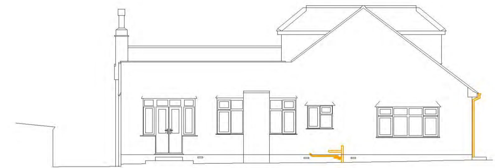
06 Existing Side Elevation GA East Facing Scale Bar 0 2 4 6 8 10