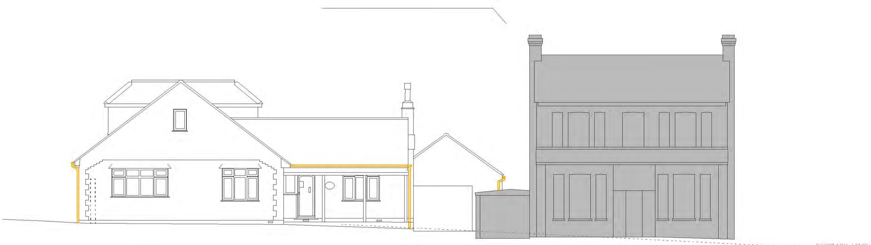
05 Existing Front Elevation GA West Facing Scale Bar 0 2 4 6 8 10